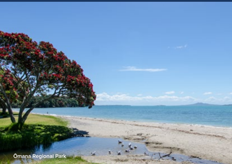
Ōmana Regional Park