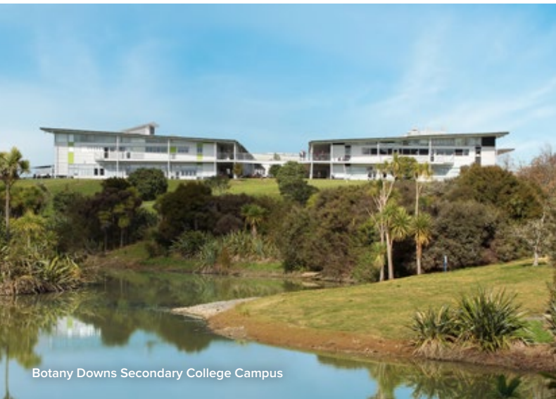
Botany Downs Secondary College Campus